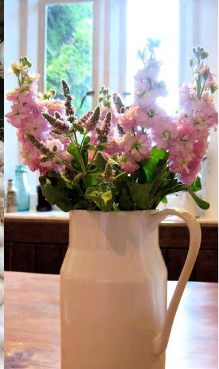
The Old Chapel ... "A million miles from your average country rental, this really feels like a fabulous home from home." - L Griffiths, Suffolk